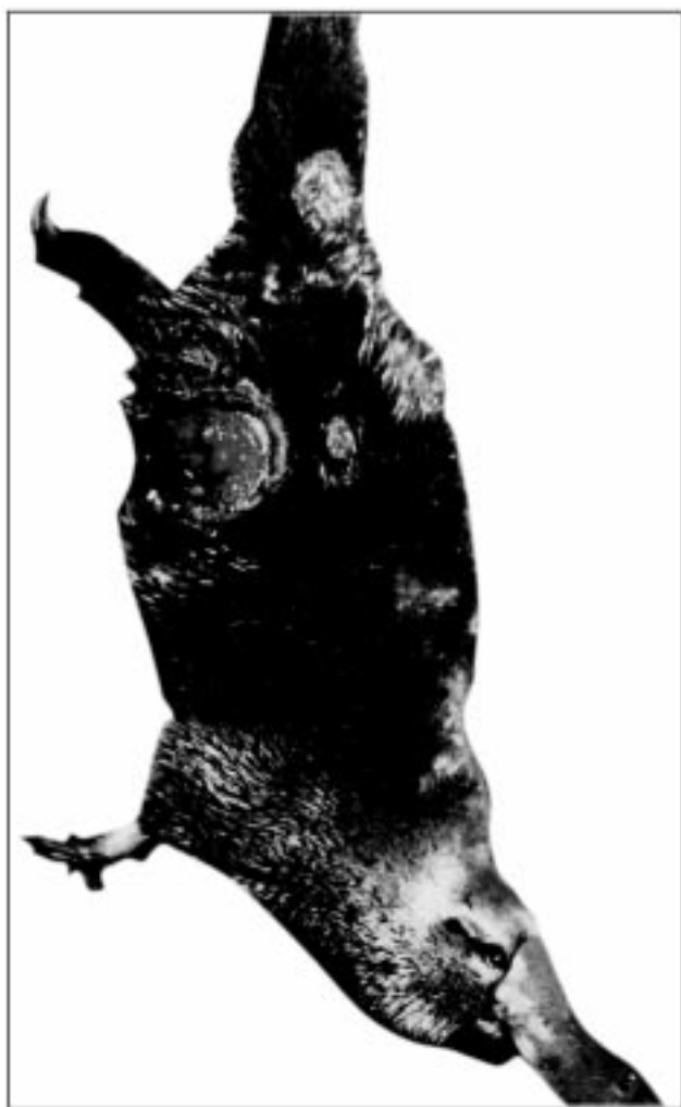
Figure 1. Severely ulcerated platypus.

pneumonia. Others are primary bacterial infections of varying importance.